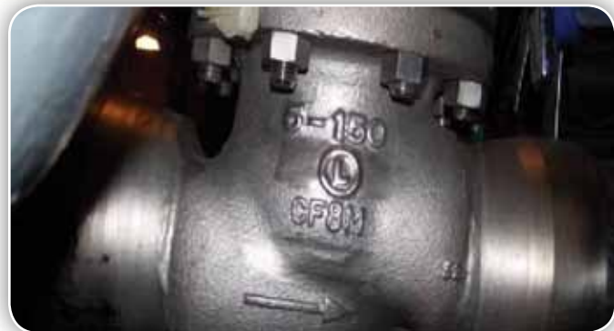
A counterfeit stop check valve was discovered in a non-safety-related application at Plant Hatch in 2007.

In response, EPRI formed a technical advisory group to update and enhance guidance on the issue. The advisory group includes members of the industry's Nuclear Procurement Issues Commit-